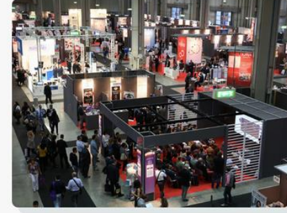
5. A city of digital and technology innovation